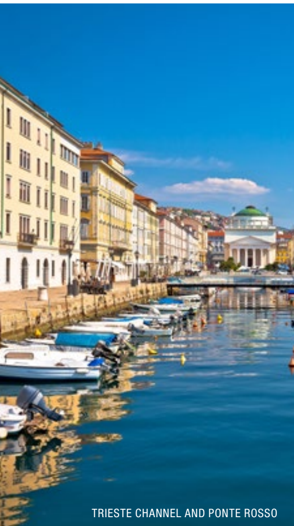
TRIESTE CHANNEL AND PONTE ROSSO